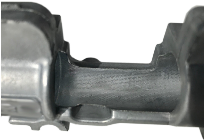
Fig. 2: Cast with the result of the functional surface

At voestalpine, with our experience and competence in steel, coating and texturing, we developed a functionalised surface for aluminium high pressure die casting, with which the results can be significantly improved.