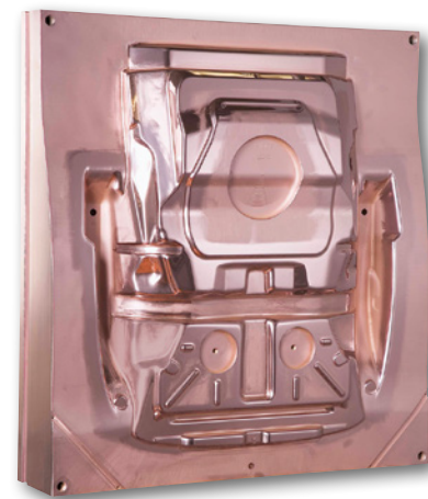
D2 forming die, coated with Duplex-VARIANTIC work material: hot rolled 1.0335 steel.