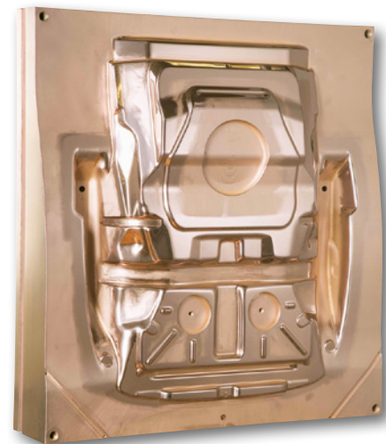
D2 forming die, coated with Duplex-VARIANTIC work material: hot rolled 1.0335 steel.